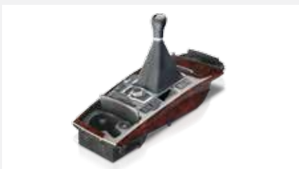
Interior: functional surfaces