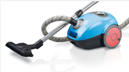
Consumer products: decorative finishers