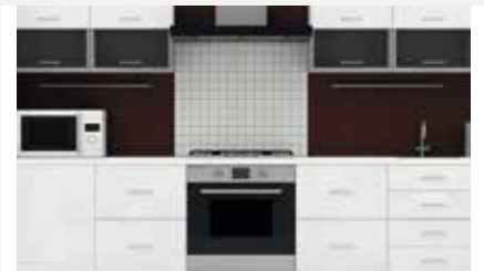
Consumer products: front trims