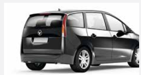
Exterior: pillar trims