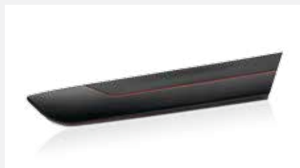
Interior: trim strips