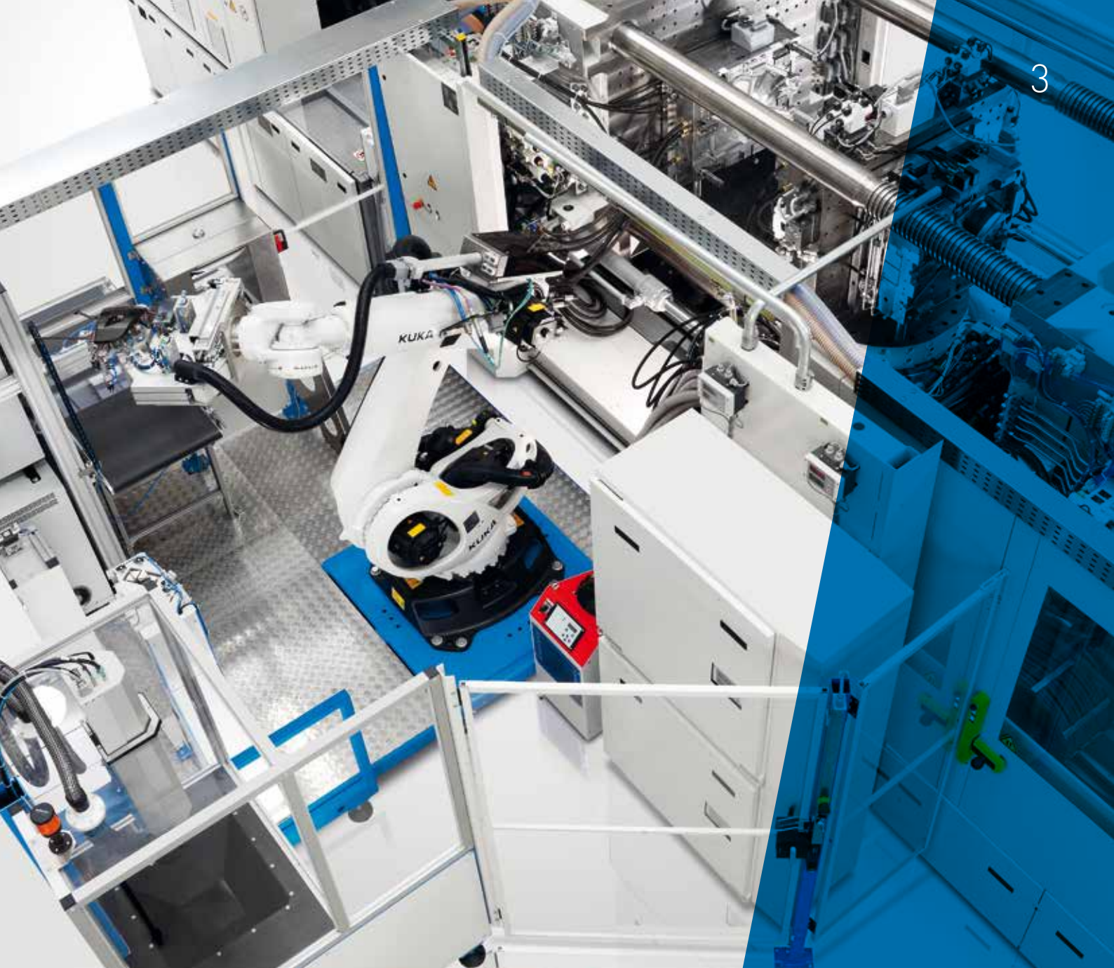
Fully automated ColorForm production system